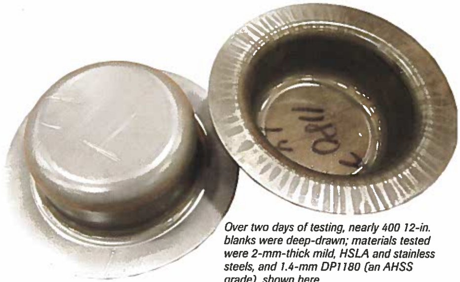
Over two days of testing, nearly 400 12-in. blanks were deep-drawn; materials tested were 2-mm-thick mild, HSLA and stainless steels, and 1.4-mm DP1180 (an AHSS grade), shown here.

Hoschouer's team began by identifying the CP-containing lubricants where the company was at risk, and then invited four suppliers to submit potential replacements to handle its most difficult mild-steel deep-drawing work, and its challenging AHSS